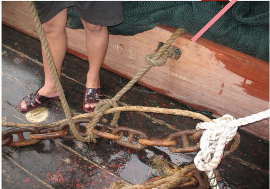
The similar wooden board causing the fatal accident

The letters coloured in blue are the locations of fishmen during the incident