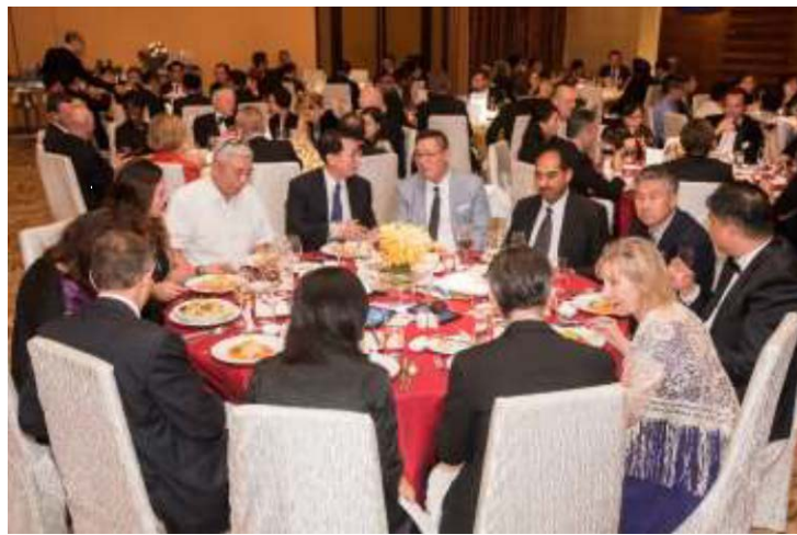
Hong Kong Ship Manager Award 2018 to Fleet Management Ltd