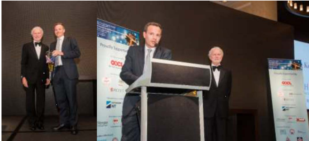
Hong Kong Ship Owner Award 2018 to Wah Kwong Maritime Transport Holdings Ltd