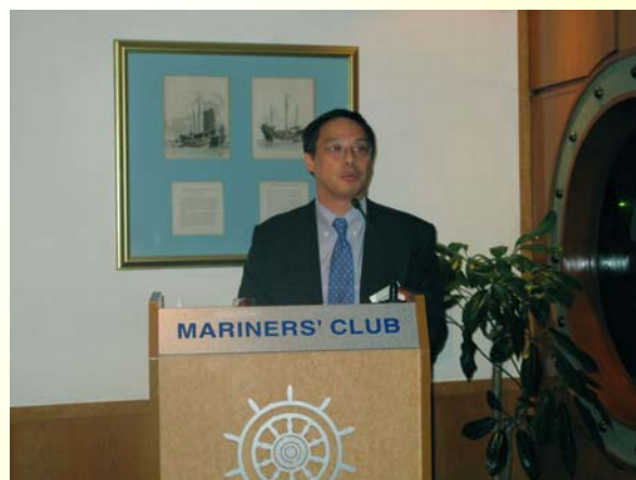
The Chairman of the Port Welfare Committee delivered his welcome speech