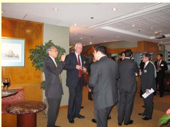
The Chairman of the Port Welfare Committee and the Director of Marine mingled with the guests during the reception