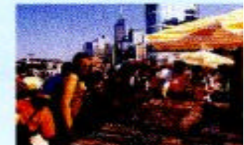
• Flea markets offering internet retail opportunities