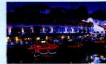
• Floating markets selling souvenirs, arts and crafts