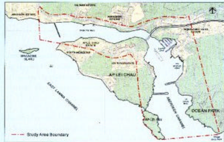
Figure 1 : The Study Area

The Study Area covers the entire Aberdeen Harbour area extending from Wah Kwai Estate in the west to Sham Shui Kok in the southeast. The Area includes the waterfront areas of Aberdeen, Ap Lei Chau and Ocean Park (Figure 1).