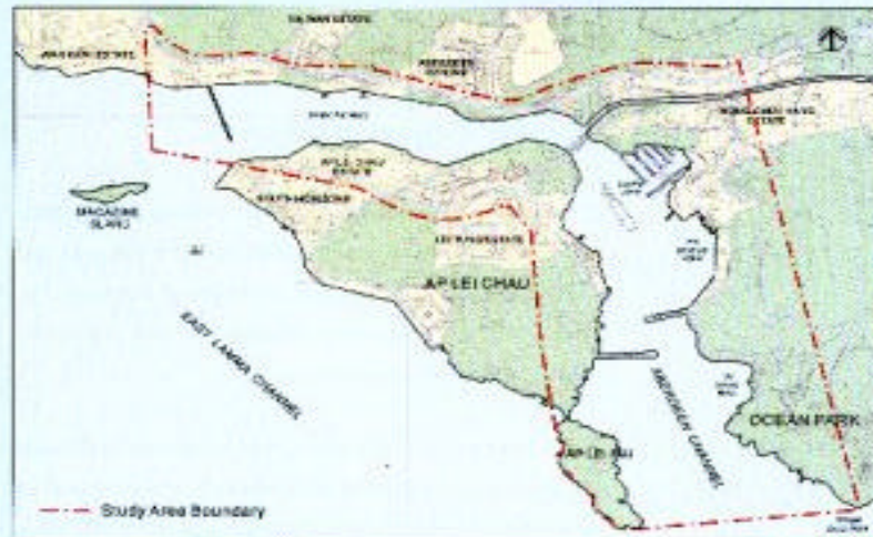
Figure 1 : The Study Area

The Study Area covers the entire Aberdeen Harbour area extending from Wah Kwai Estate in the west to Sham Shui Kok in the southeast. The Area includes the waterfront areas of Aberdeen, Ap Lei Chau and Ocean Park (Figure 1).