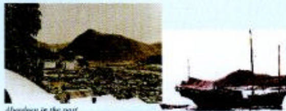
Aberdeen in the past

Aberdeen Harbour has its unique maritime and fishing history. It has been a known seaport since the Ming Dynasty. It has also been home for fishing fleets and floating village.