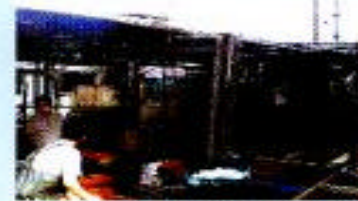
• Live fish market maintaining and enhancing fishing activities in Aberdeen Harbour