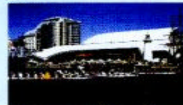
• Maritime museum showing the maritime history of Hong Kong and Aberdeen Harbour

Based on the Fishing Port Theme, it is proposed to provide a Fisherman's Wharf Development within Aberdeen Harbour. The term "Fisherman's Wharf Development" has been widely used and has been interpreted in a range of ways. According to the Study, Fisherman's Wharf Development is defined as the redevelopment of a traditional fishing port/area. Similar to other Fisherman's Wharves abroad, the proposed Fisherman's Wharf Development will maintain and enhance the existing fishing activities in the Harbour while incorporating the following tourism and recreation uses: