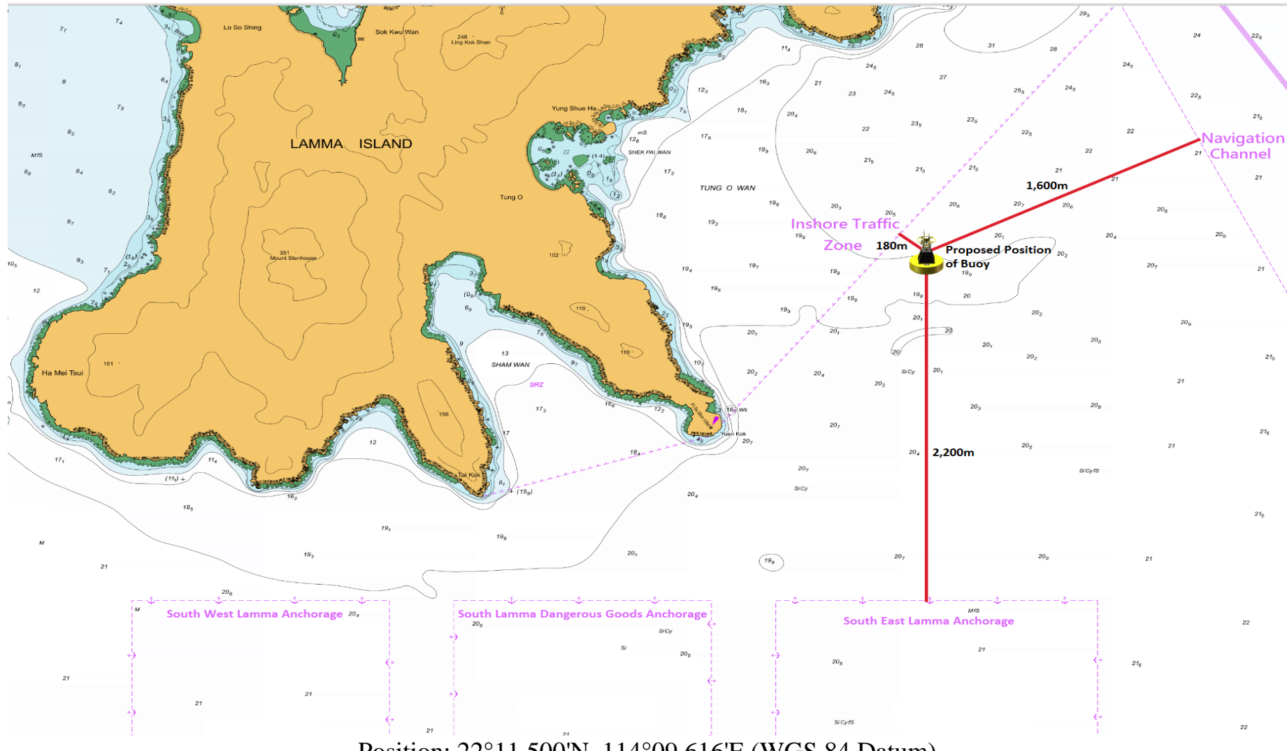
Location of the proposed real-time hydrographic and water quality monitoring station

Position: 22°11.500'N 114°09.616'E (WGS 84 Datum)