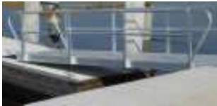
Photo 4 – Pier Ladders