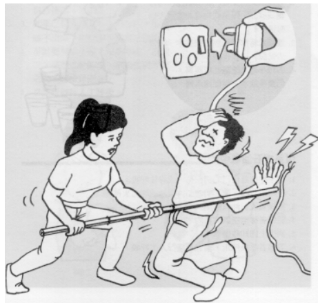
Figure 3 : Shut off the electric current or separate the victim from the electric source before touch him (The Sketch is extracted from the First Aid Manual , published by the Department of Health)