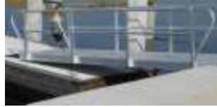
Photo 4 – Pier Ladders