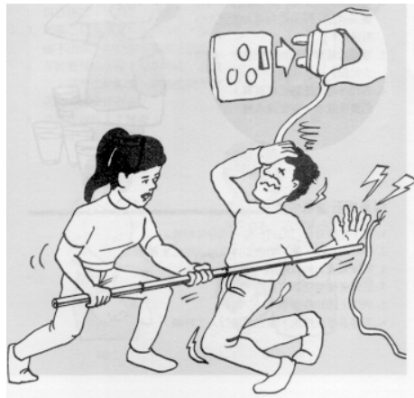
Figure 3 : Shut off the electric current or separate the victim from the electric source before touch him (The Sketch is extracted from the First Aid Manual , published by the Department of Health)