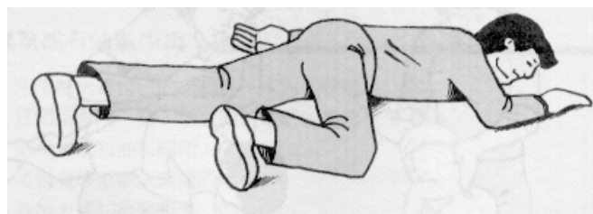
Figure 2 : Recovery position (The Sketch is extracted from the First Aid Manual , published by the Department of Health)