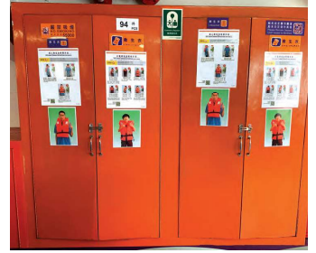
存放位一：救生衣箱內 Location 1: Lifejacket cabinets