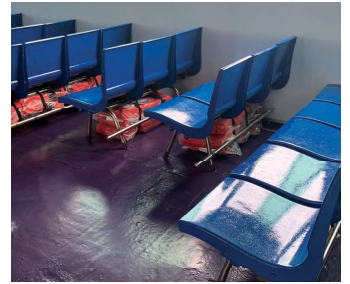
存放位二：椅底 Location 2: Under the chair