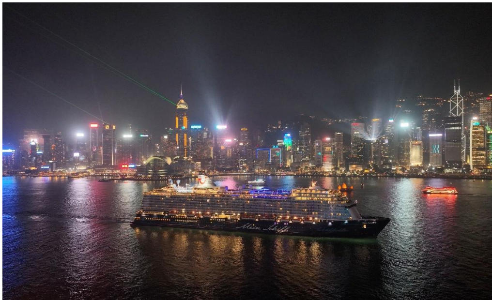
Mein Schiff 5 transiting the Central Fairway upon departure on 9 March 2023

11. Since the resumption of international cruises in January 2023, several cruise ships on their maiden calls to Hong Kong have been permitted to transit the Central Fairway. Cruise passengers onboard were able to enjoy the magnificent views of Hong Kong's skyline and the Symphony of Lights show, contributing greatly to the success of the "Hello Hong Kong" campaign in welcoming visitors. From media reports, posts on social media as well as feedback obtained globally by the Hong Kong Tourism Board, cruise ships transiting the Central Fairway have been very well received by both cruise passengers and cruise lines. The relevant reports and posts have also substantially enhanced the worldwide image of Hong Kong.